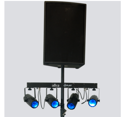
Safely mounts to most tripods and speaker stands