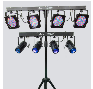
Safely mounts to 4BAR